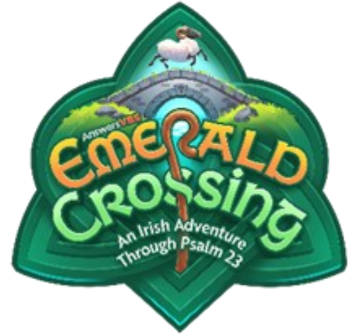
Photo Release Form

Temple Lutheran Church 501 Brookline Blvd Havertown, PA 19083